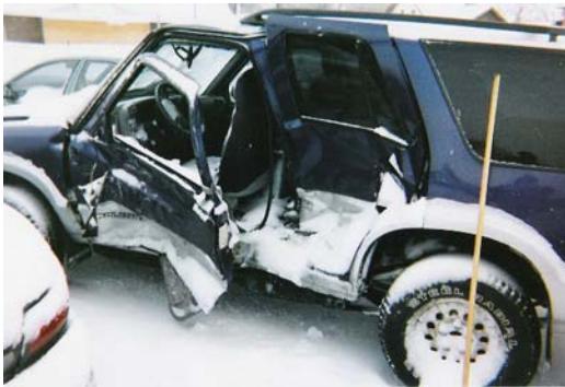
A photo of a car taken at the scene of a drink driving accident.

Teenage drink driving poses a threat to everyone on the road. Teenagers put themselves at greater risk of injury when involved in drink driving situations because they take greater risks and exercise less caution. For instance, 75 per cent of teenage drink driving participants were not wearing their seatbelt at the time of an accident.